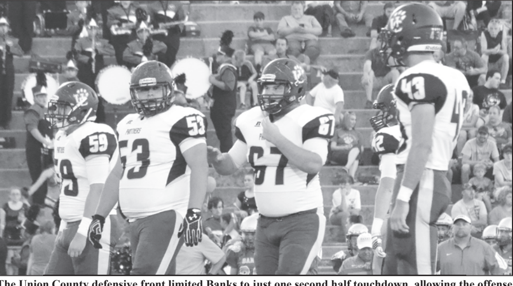
The Union County defensive front limited Banks to just one second half touchdown, allowing the offense to pull away for the 14-point victory.